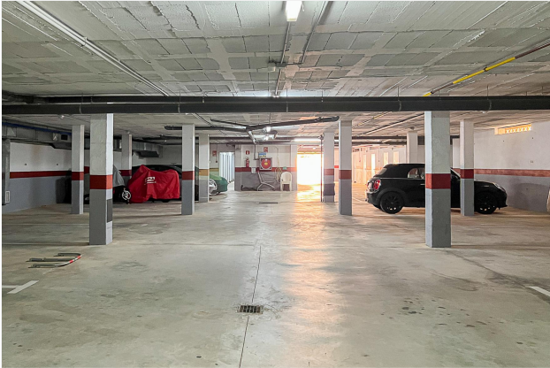
Parking space in garage