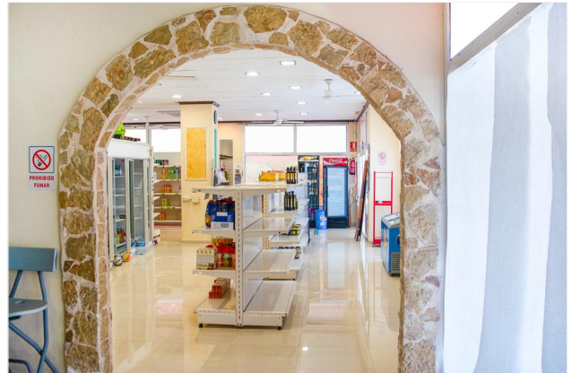
Blick in den Verkaufsraum