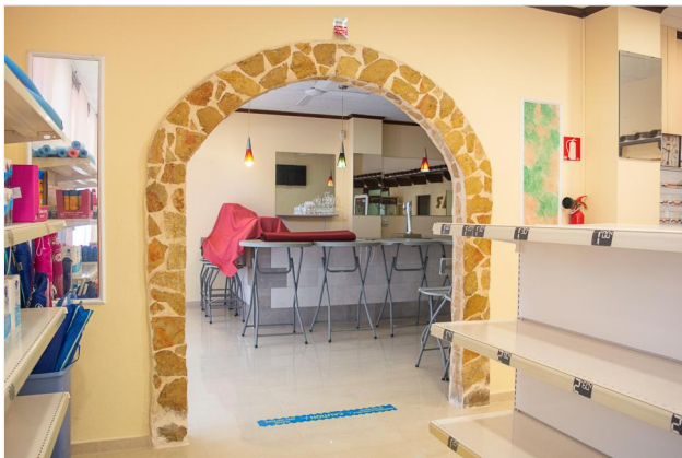
Blick in die Bar