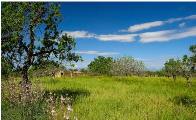
... with wonderful panoramic views...