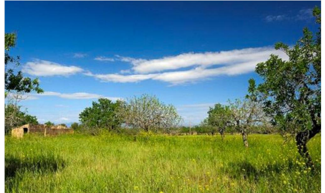
Fantastic building plot...