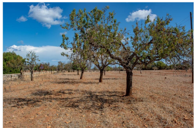
...slightly hilly, with almond trees...