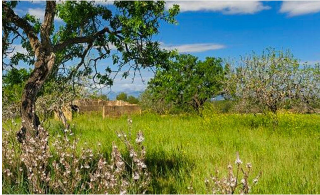
... over the countryside to the sea