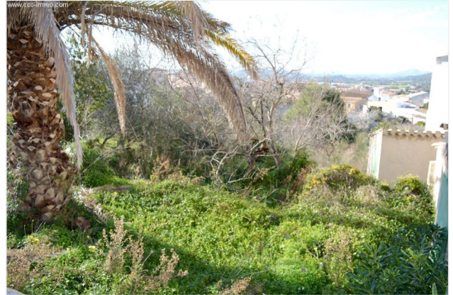
Plot of land with mountain view