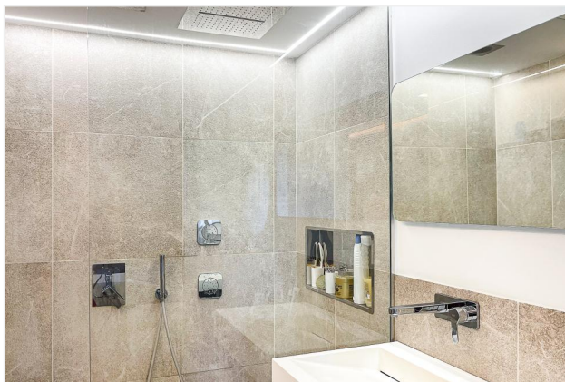
...shower room + bathtub