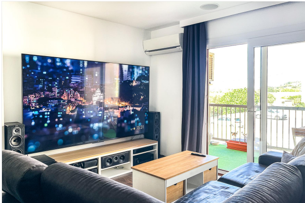
...surround sound system