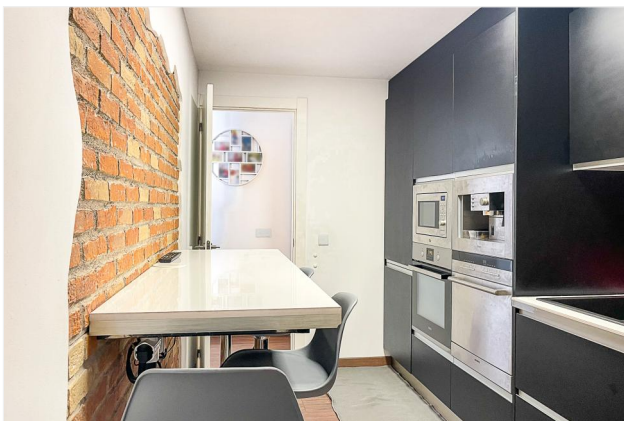
...with all major brand appliances