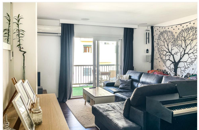
Living Room with...