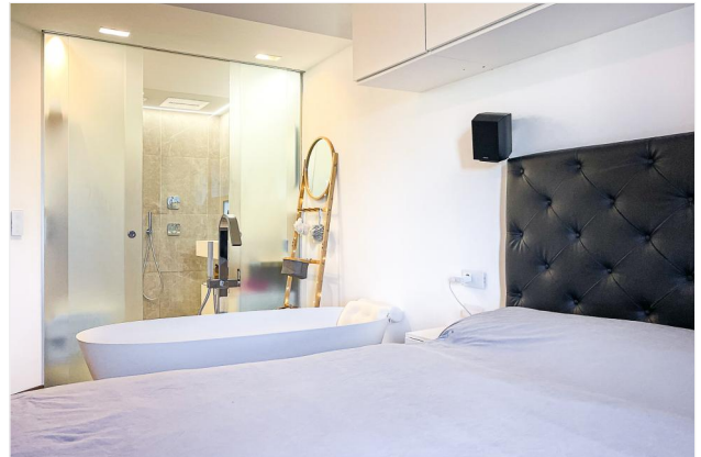
Master bedroom with...