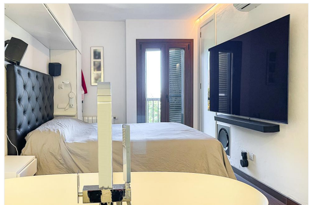
Modern apartment in Capdepera