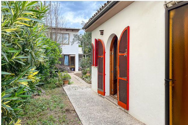
Back garden access