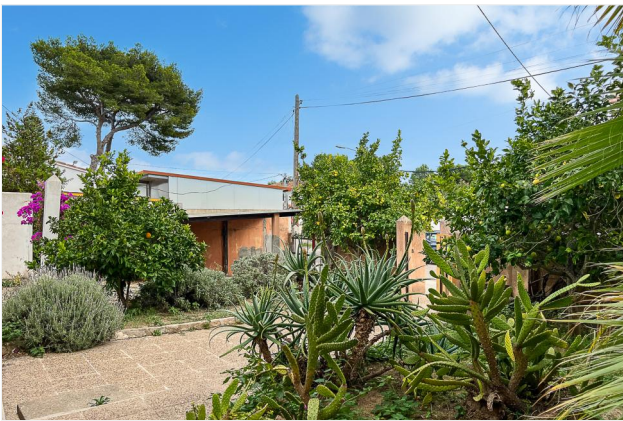
Garden in front of the house