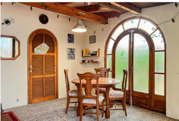
Entrance with fireplace