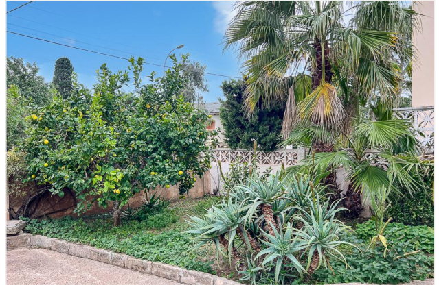
Garden in front of the house