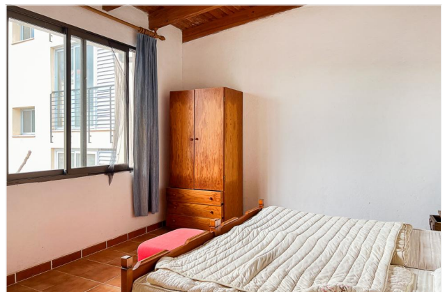
Guest room 1