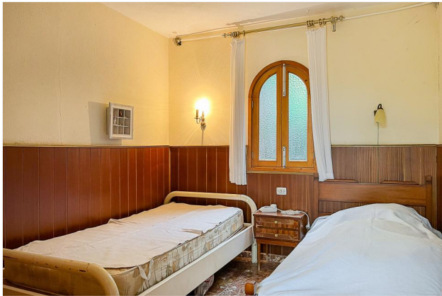
Guest room 2