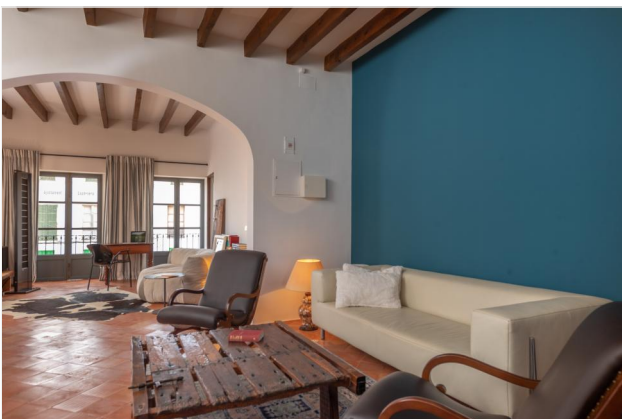
Music and living room