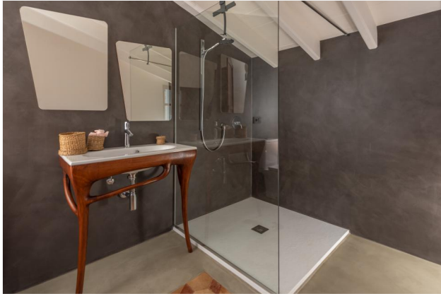
...and bathroom with shower