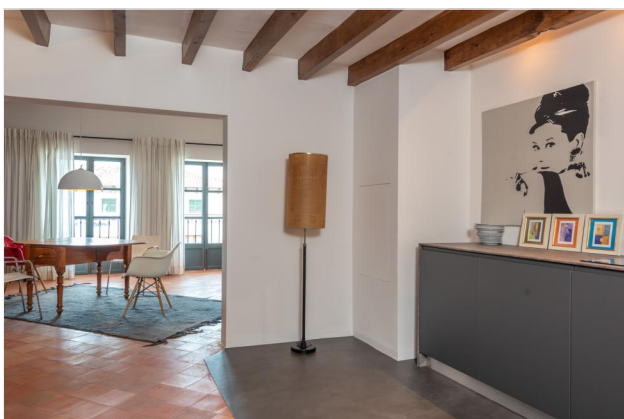
...and second kitchen