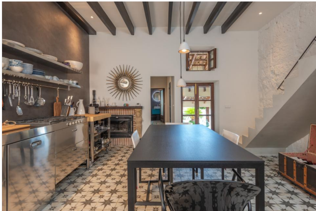
Stainless steel kitchen