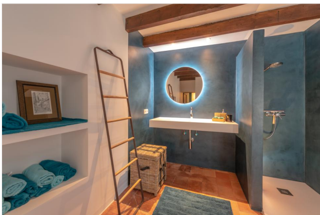
...with bathroom with shower