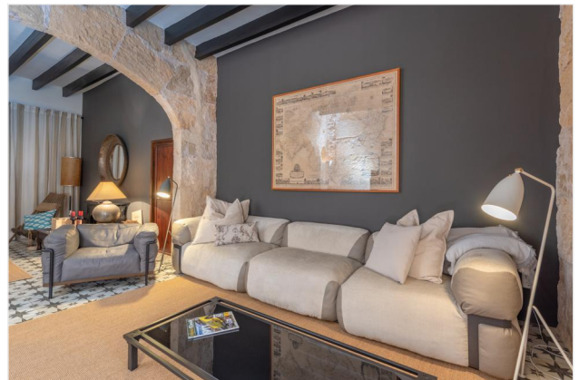
Exclusive designer furniture