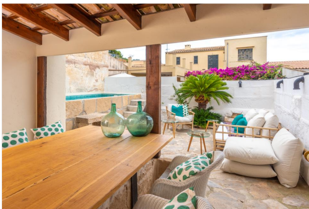
Dining table in the patio