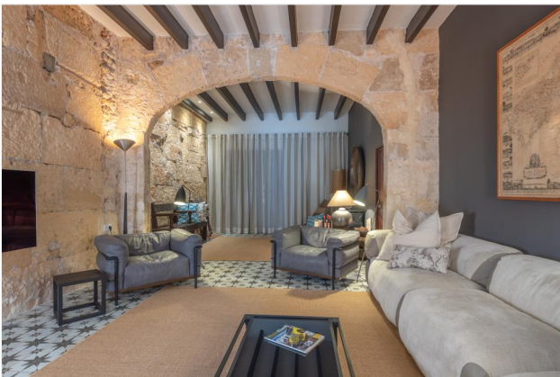
Living area with...