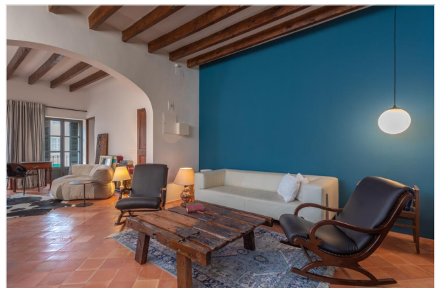
Living room first floor...