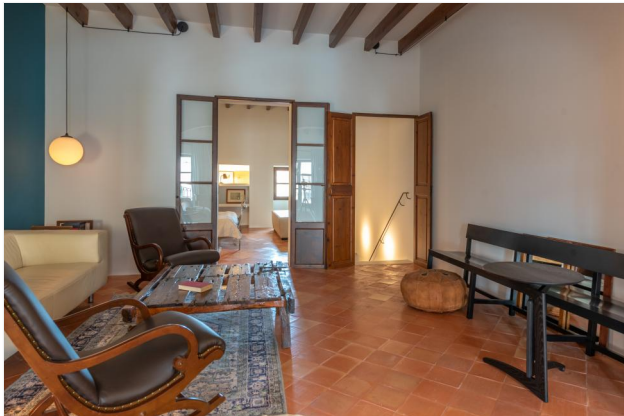
...with access to the bedroom