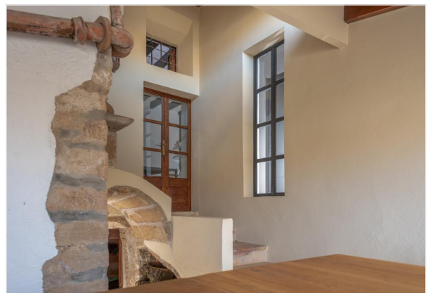
Impression of the patio