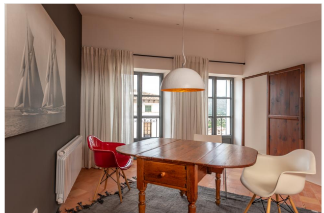
Dining room upper floor...