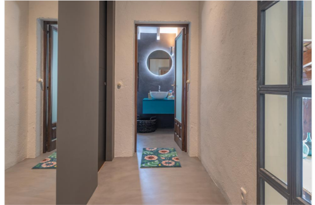
Storage room in the corridor