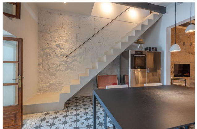
Stairs of micro cement