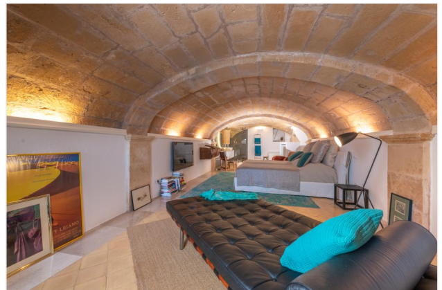
...and reading corner