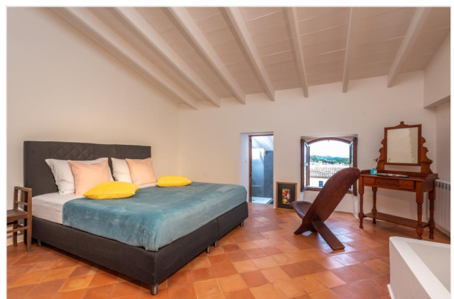
Bedroom with small sea view...