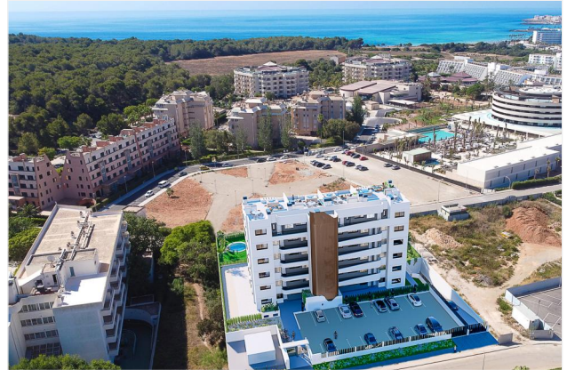
Blick von oben