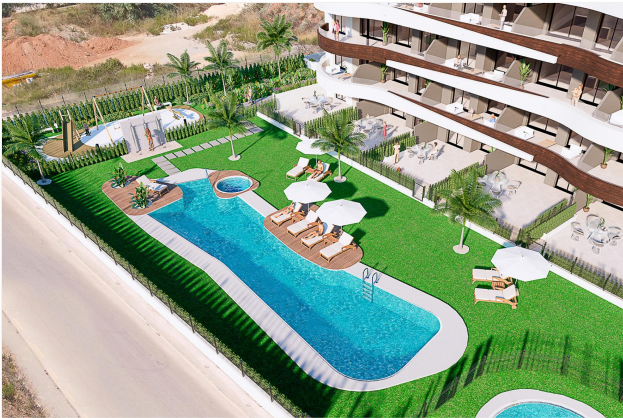
Poolbereich von oben