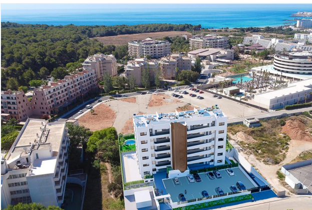
Blick von oben