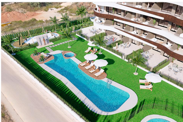
Poolbereich von oben