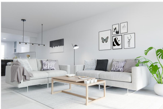
Visualisation living room