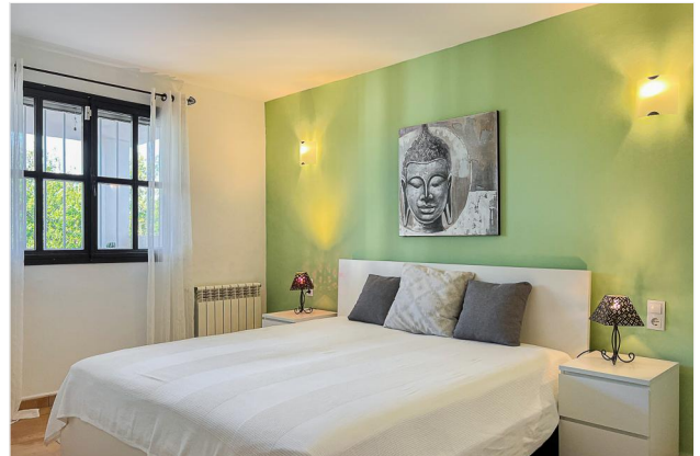
Guest room 2