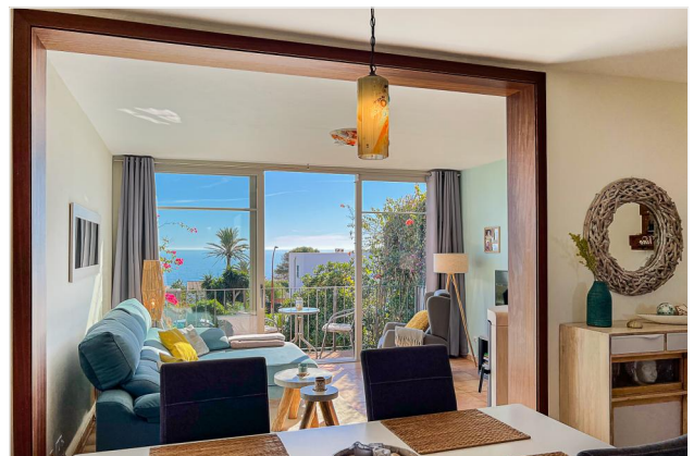
Living room with...