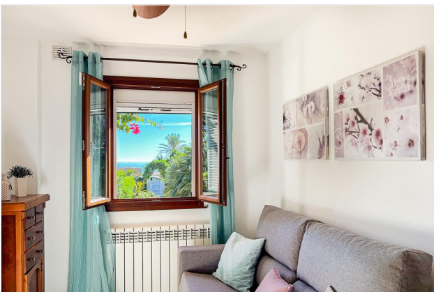
Guest room 1 with...