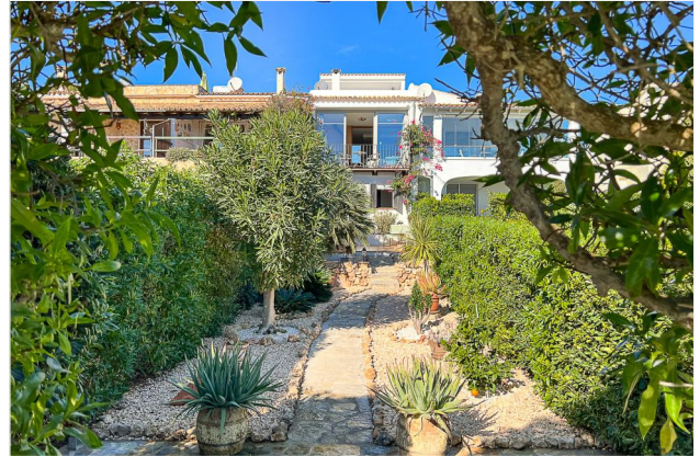
View from the street