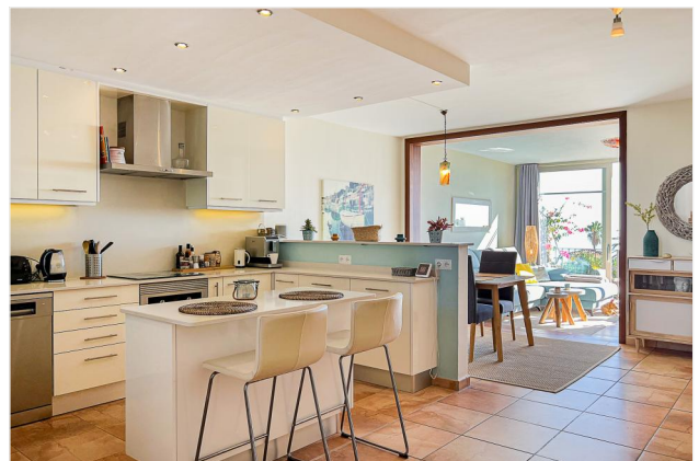
Open-plan living/dining area