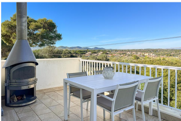
Balcony with Tramuntana view