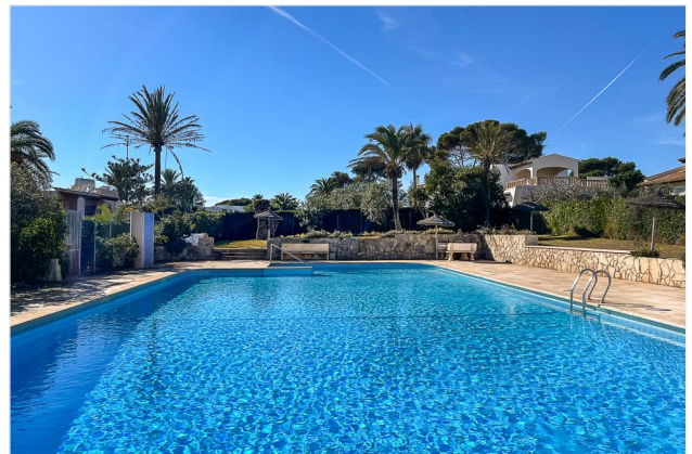
Community pool (optional)