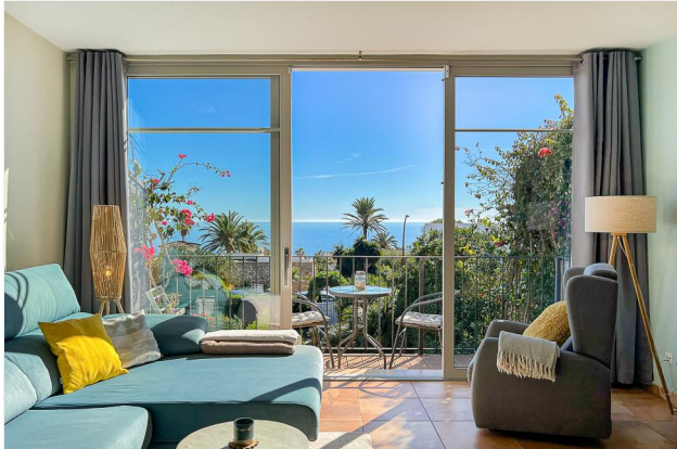
...breathtaking sea view