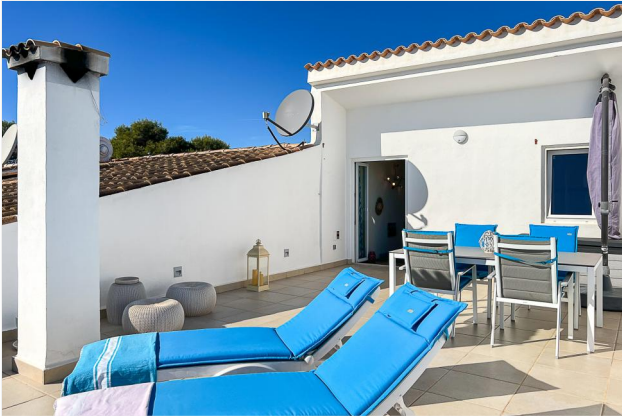
Roof terrace access