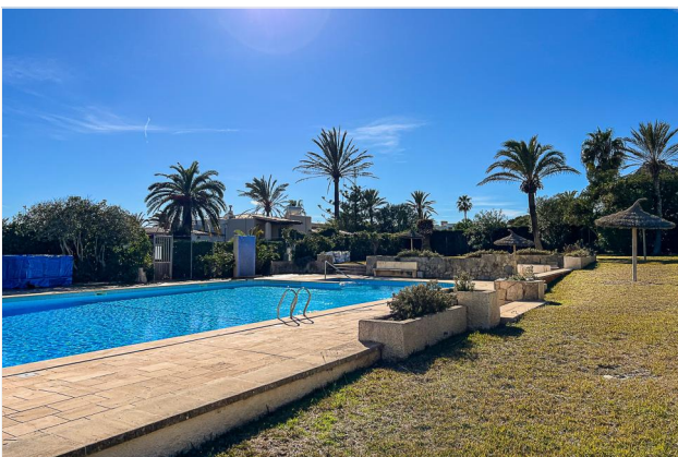
With lying area