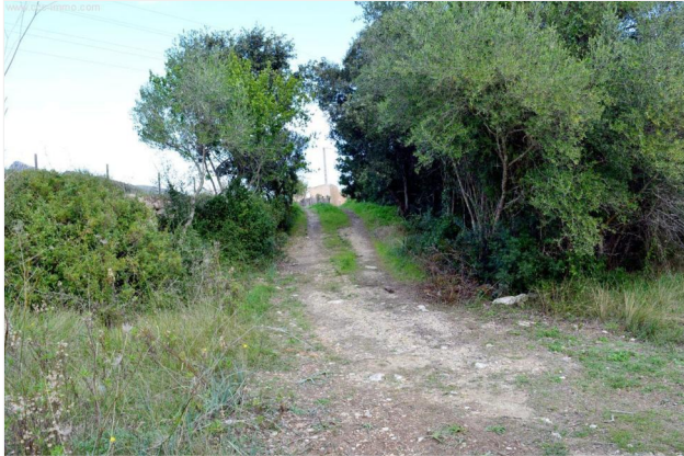
Access to the property