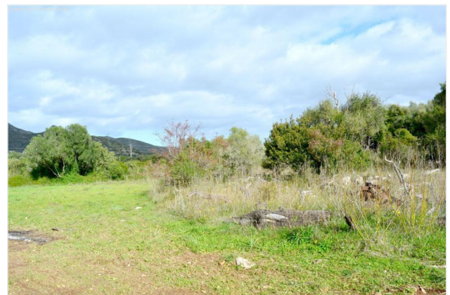
Plenty of space for your own ideas