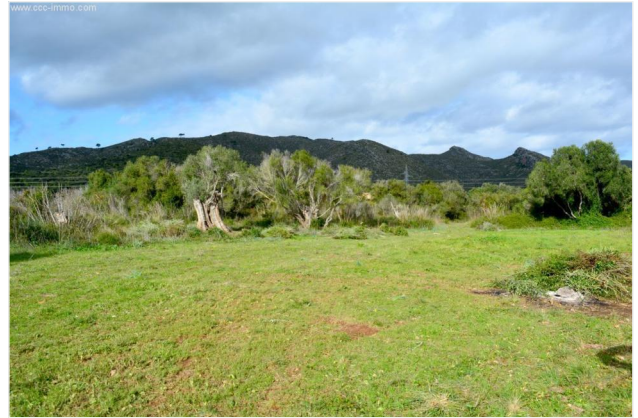
View over the property