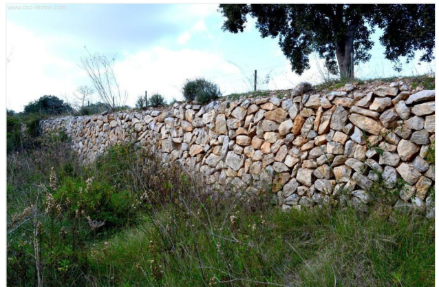
...completely fenced-in property