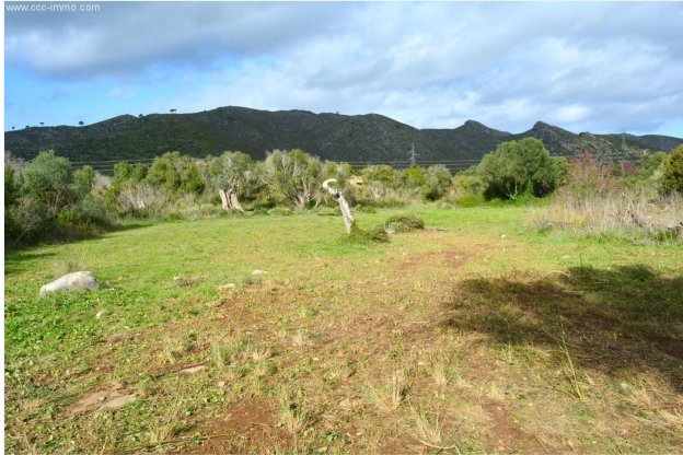
View over the property