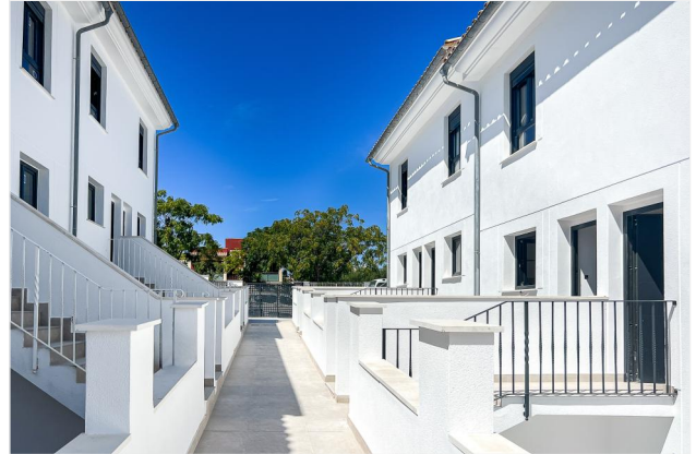
Exterior view residential complex