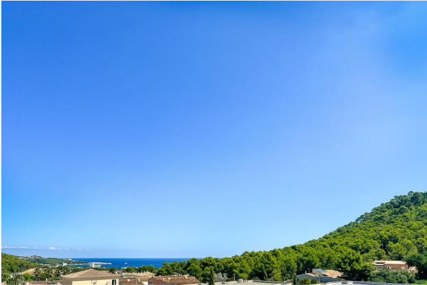
View roof terrace