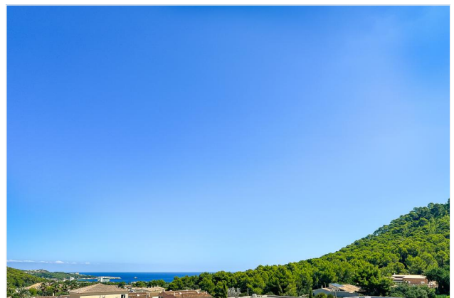
View roof terrace