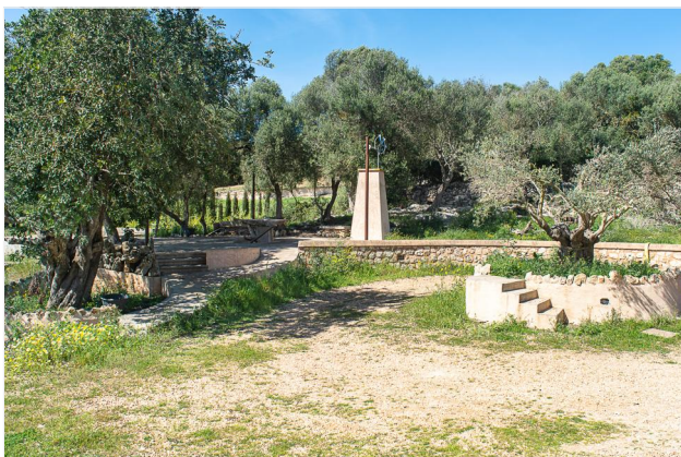
... much parking space