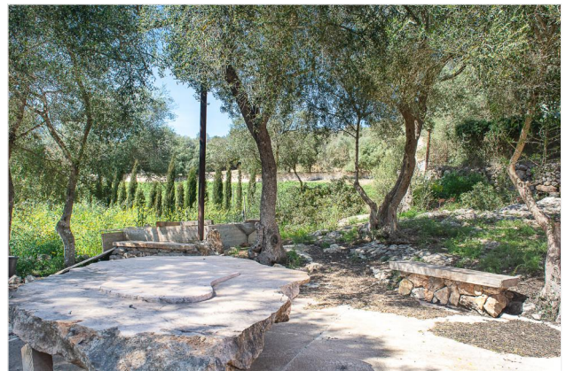
In front of the house...