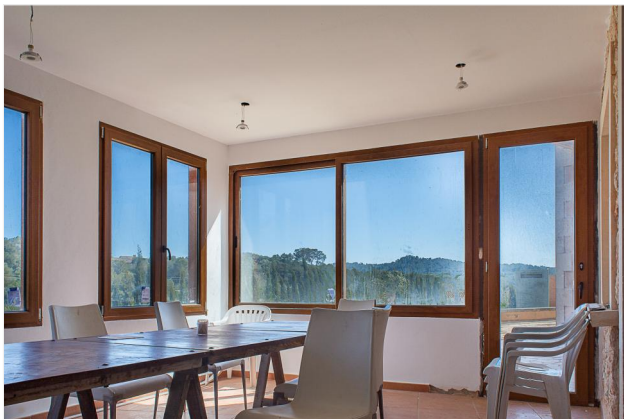
Views from the apartment