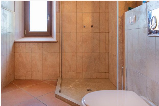
Modern bathroom with shower and window