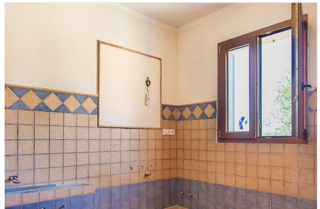
Mediterranean bathroom with window