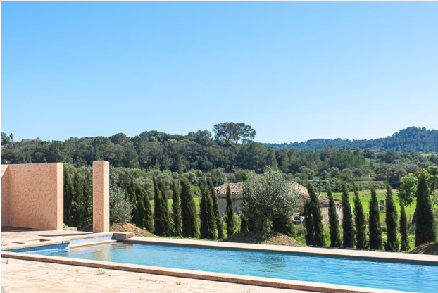
... over landscape and hills