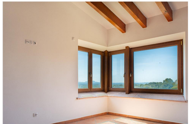
Views from first floor