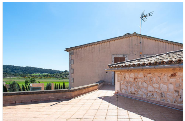
Huge roof terrace