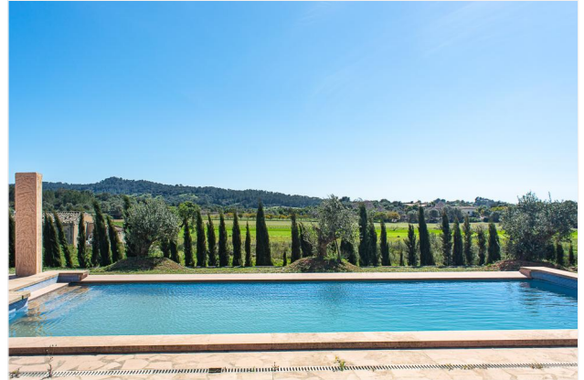
Huge pool with views and...