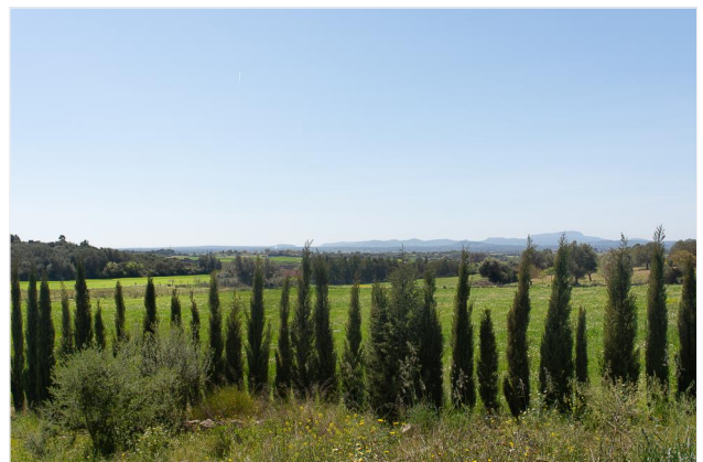
Fantastic panoramic view...