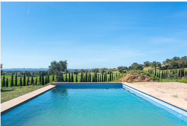
... sun terrace