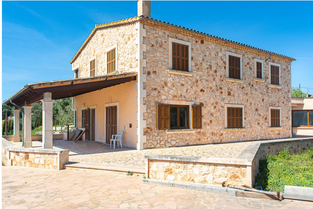
View onto one side