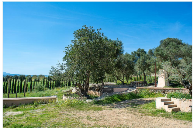
In front of the house