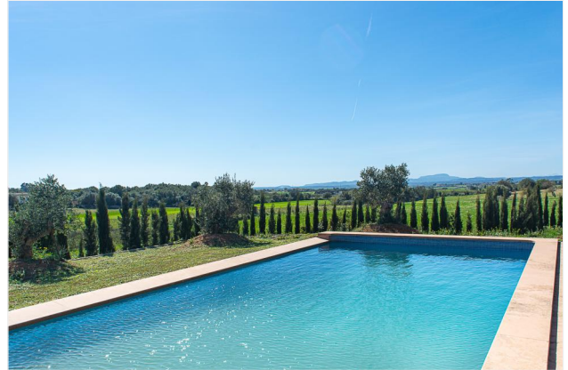
Pool with panoramic views