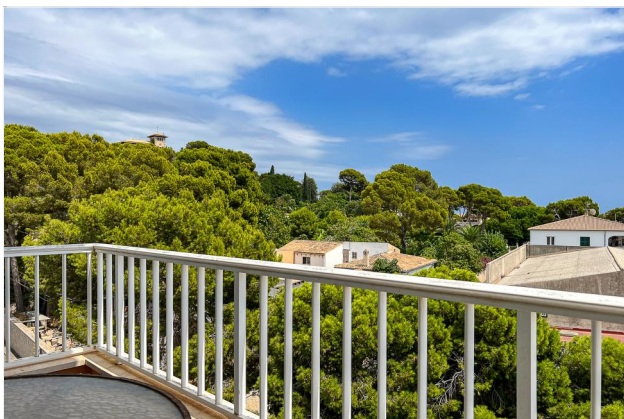
View of Villa March