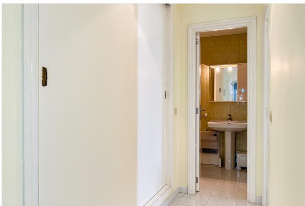
Hallway with fitted wardrobe