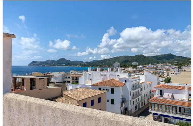
Roof terrace view