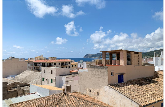
Sea view from the terrace