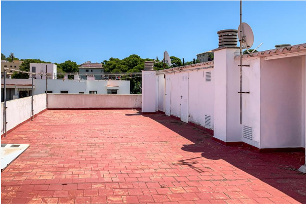
Community roof terrace