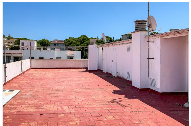
Community roof terrace