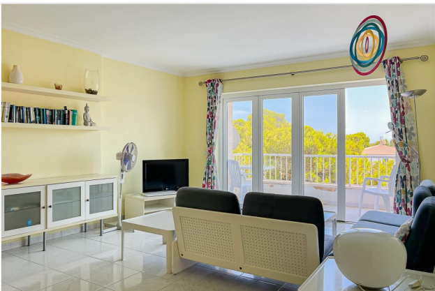
Living room with...