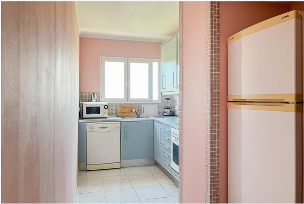
Entrance to the...