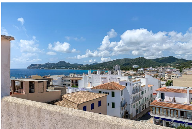
Roof terrace view