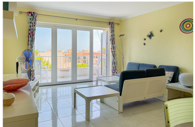
...very much light