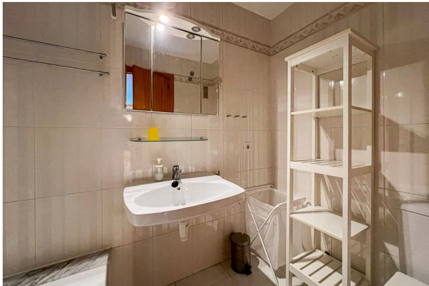
Second bathroom with...