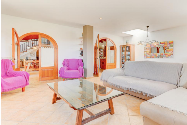
Living area with...