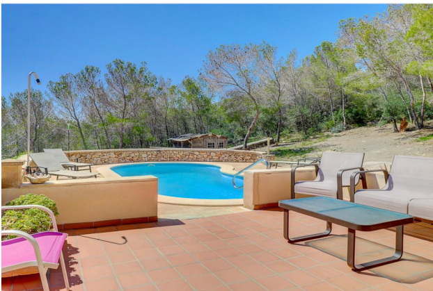
...View of the pool