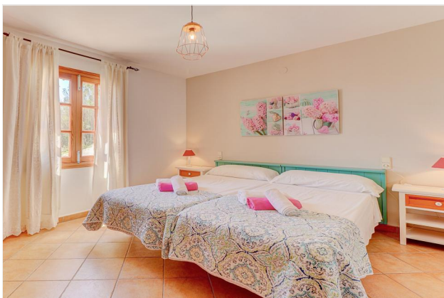
Double Bedroom 1