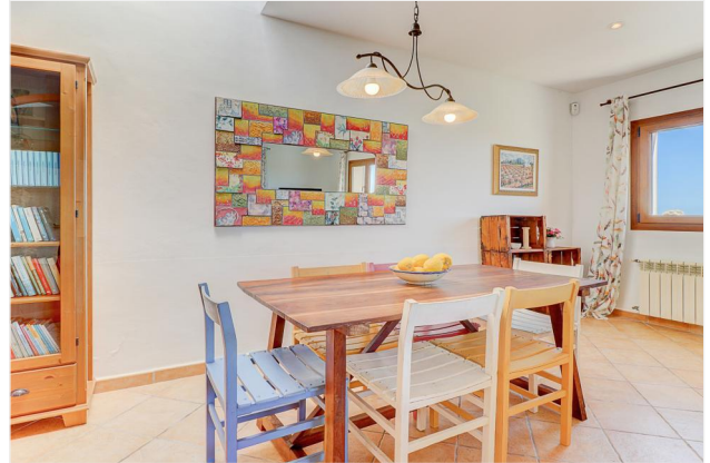
...another dining area