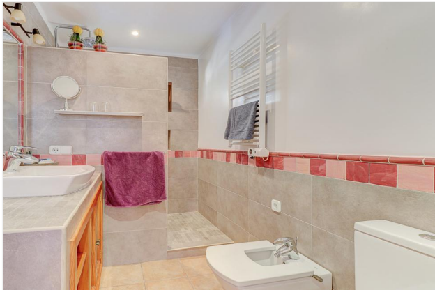
Bathroom with shower