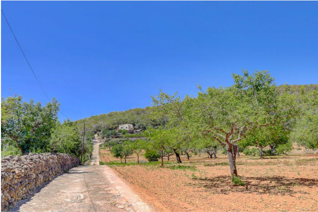
Driveway to the house