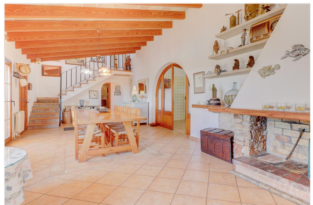
Dining area with fireplace