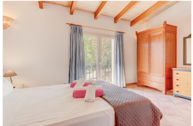
Double Bedroom 3 with...