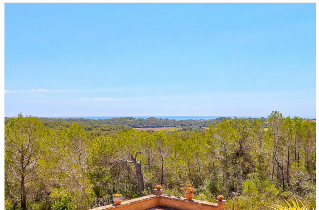
Wonderful distant sea view