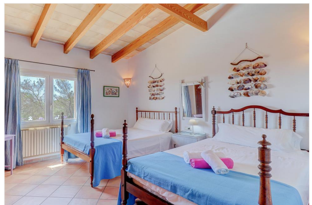
Double Bedroom 4