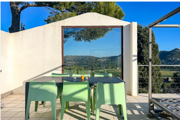
Views from the terrace