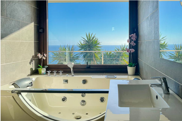
Bathroom with Jacuzzi