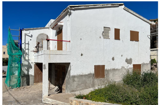
House under construction (status April 2023)