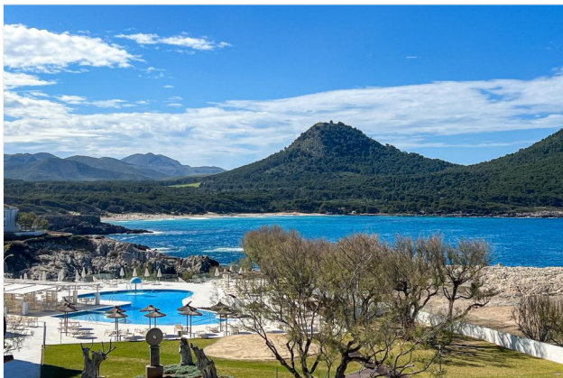
View of Cala Agulla