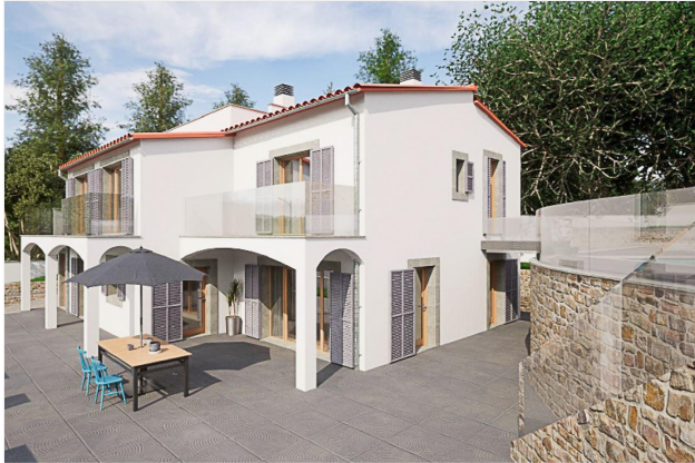
Modern renovated villa