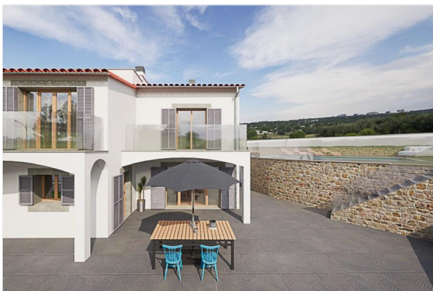
Large terrace areas