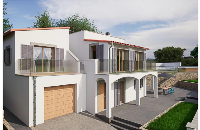
Future exterior view