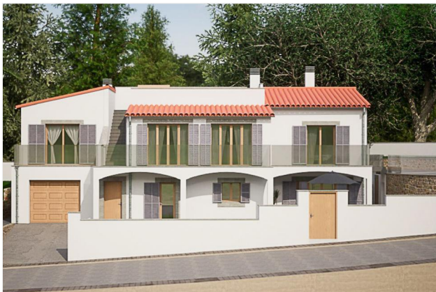
View of the house from the street