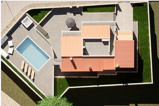
Bird's eye view/roof terrace