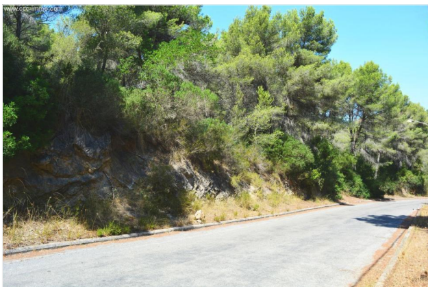
... and very natural environment