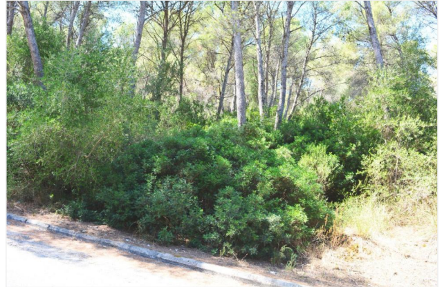
Plot with light tree population