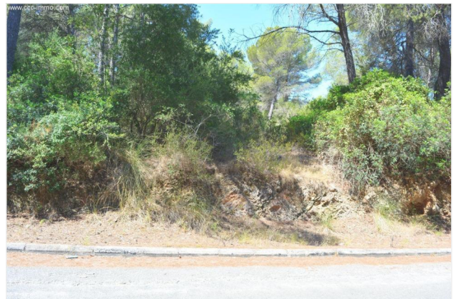
... in a quiet location