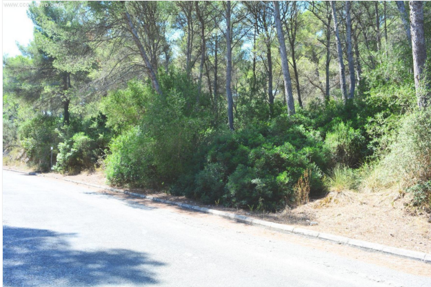
Easy access to the property