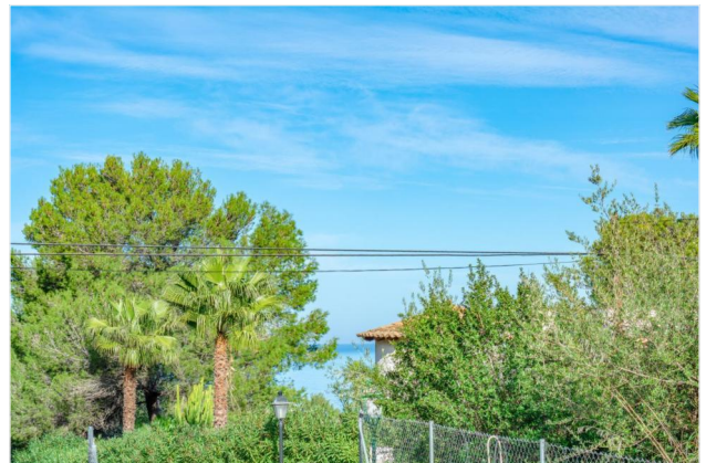
Small sea view through the trees