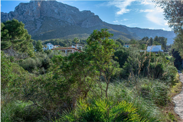
Fantastic view of the surrounding mountain la