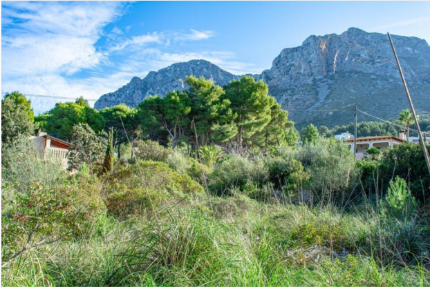
Beautiful landscape in the background