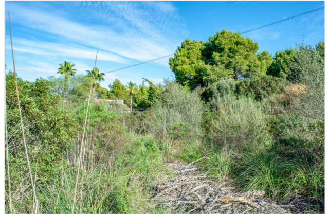
Plot in quiet location