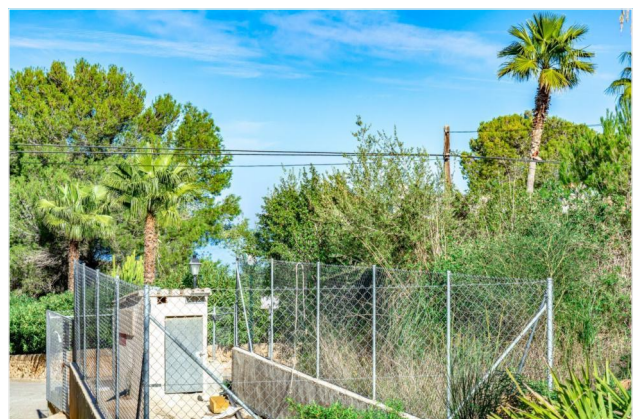
Urban water reservoir at the boundary of the