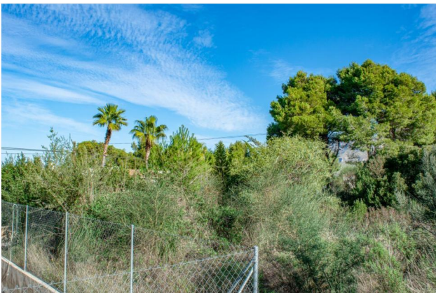
View into the nature