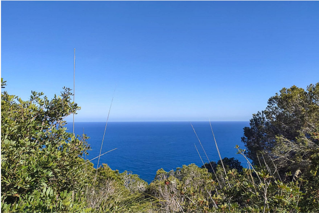
Fantastic sea view!