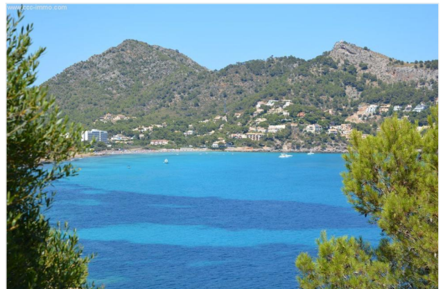
The marvellous bay of Canyamel