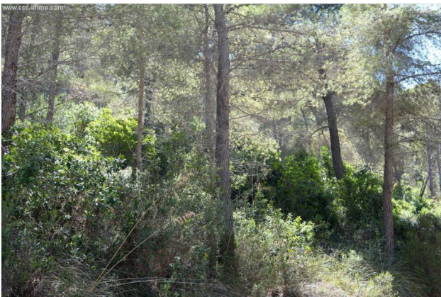
Plot with pine trees