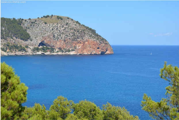
Fantastic sea views!