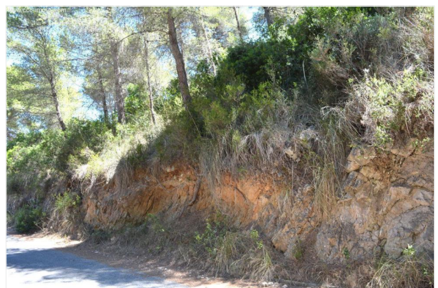
View to the plot