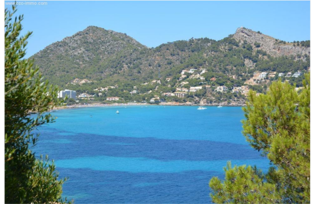
The marvellous bay of Canyamel