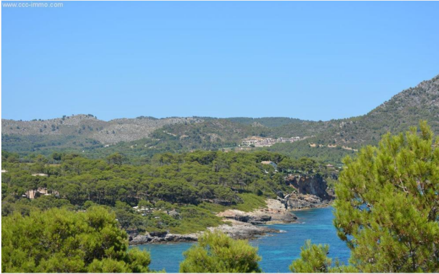
Bay and nature