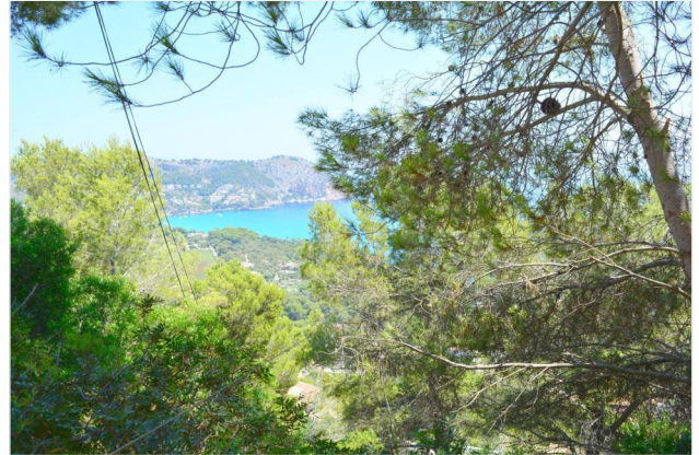
View towards the bay of Canyamel