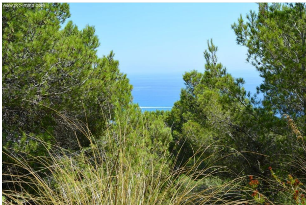
Fantastic sea view