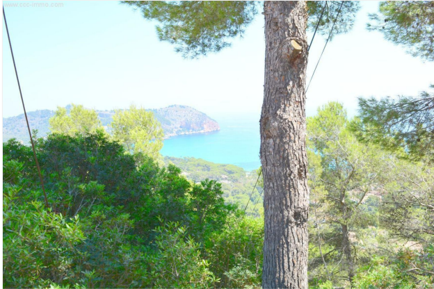
View from the plot