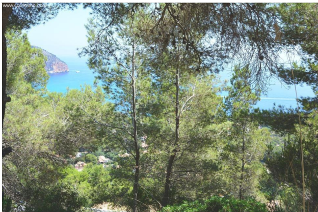
Plot on a slope