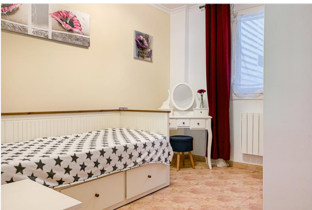
Single bedroom with wardrobe