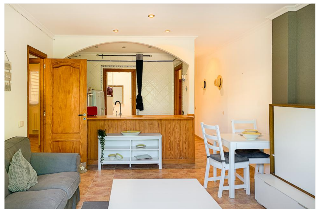
Open kitchen with access...