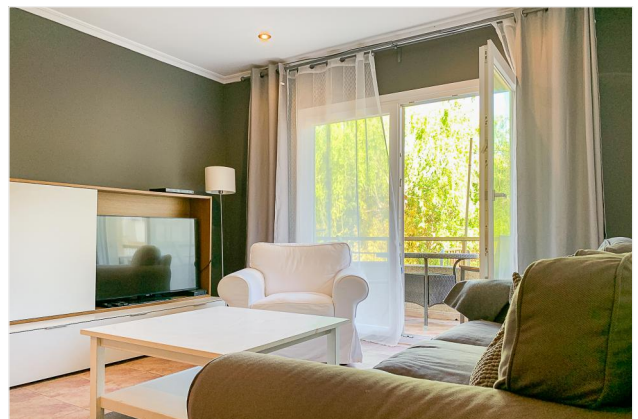
Living room with...