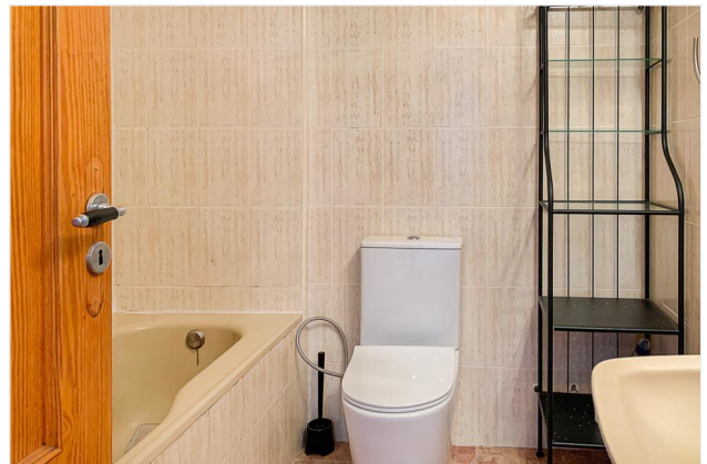
Bathroom with tub