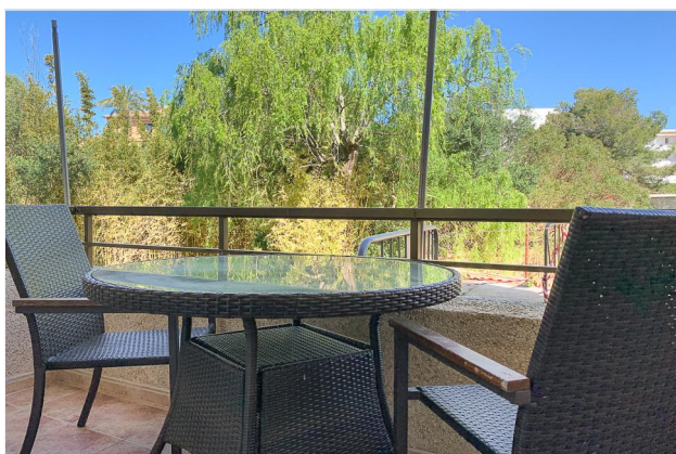
...access to the balcony