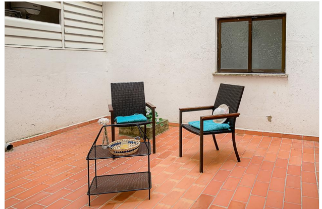
...to the patio