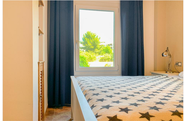
Double bedroom with...