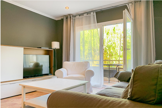
Well maintained flat in Cala Ratjada