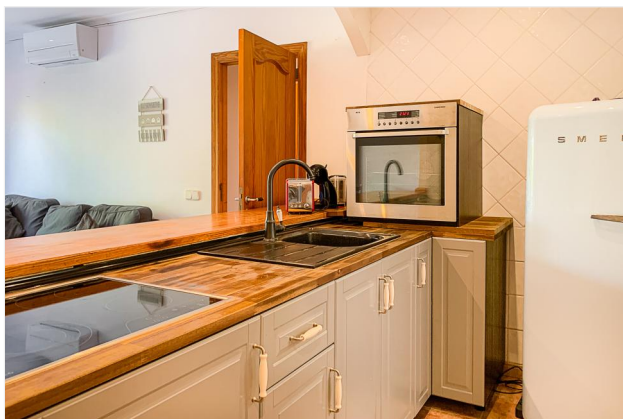
Modern fitted kitchen