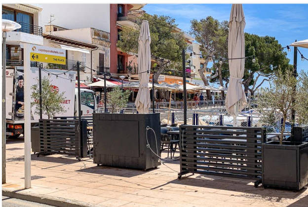
Terrace with agreement of use