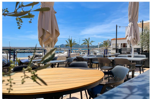
Harbour view from the terrace