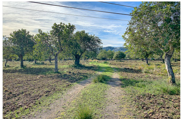
Driveway coming from the entrance...