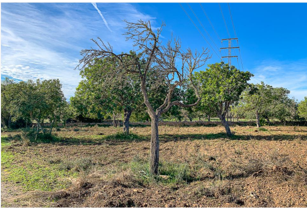
...and almond trees as well