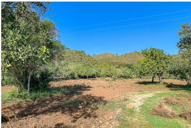
One of the great views of the property...