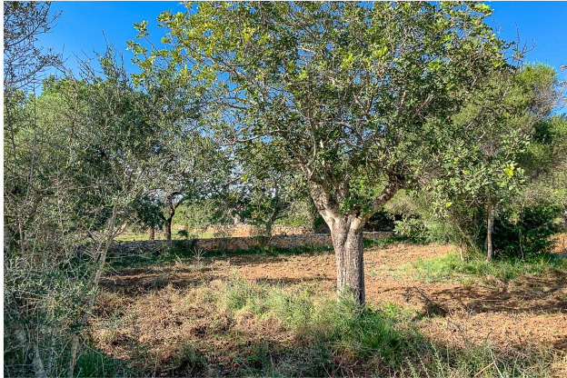
Typical Mallorcan dry stone wall for demarcat