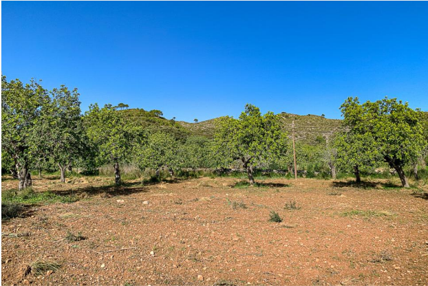
...another beautiful view of the finca