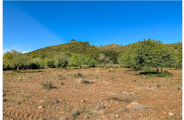
Wonderful view of the mountain silhouette