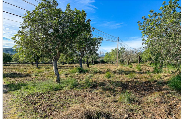
Algunos de los muchos algarrobos