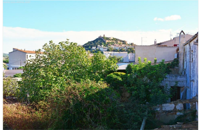
View to the Castle of Capdepera