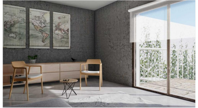
Impressions after conversion