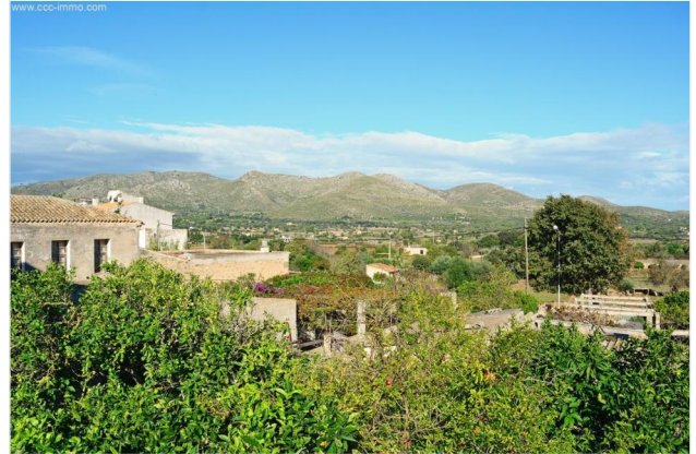
Beautiful panoramic view