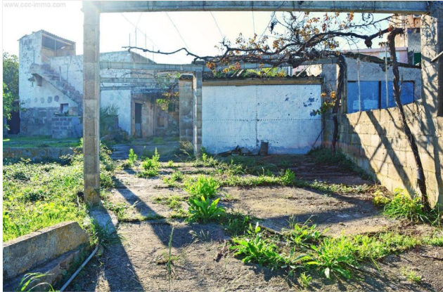
View from the back part of the garden