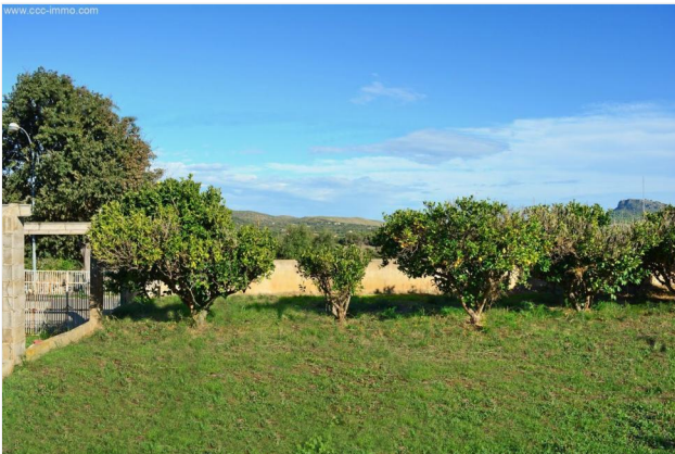
View to the garden