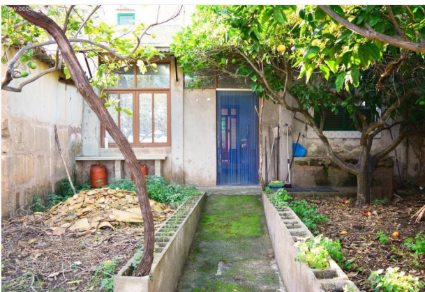
Access from the garden