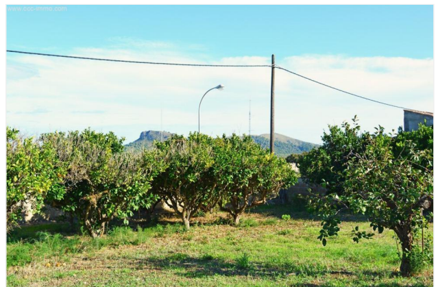
Garden with lemon trees