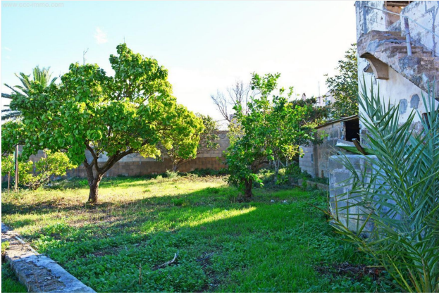
View to the garden