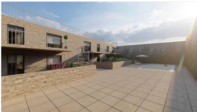
Impressions after conversion