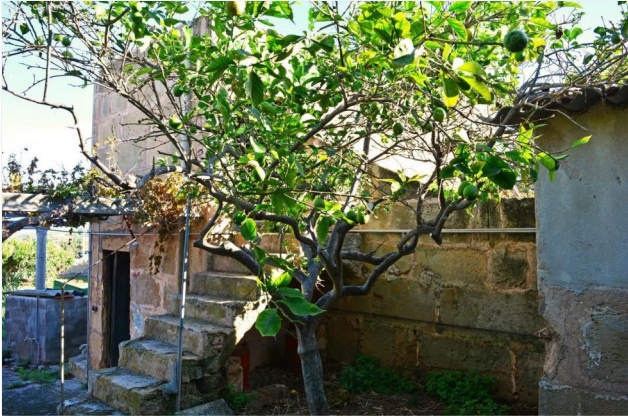
Antique side facade