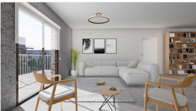
Impressions after conversion