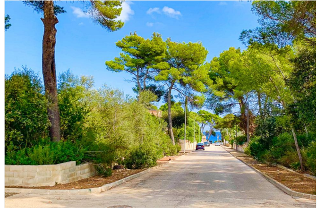
...near the sea