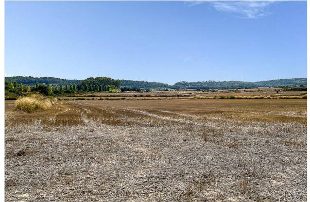
View of the whole plot