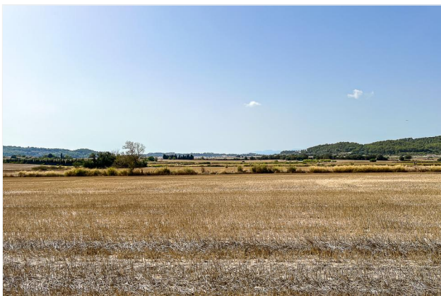
Direction Sant Joan