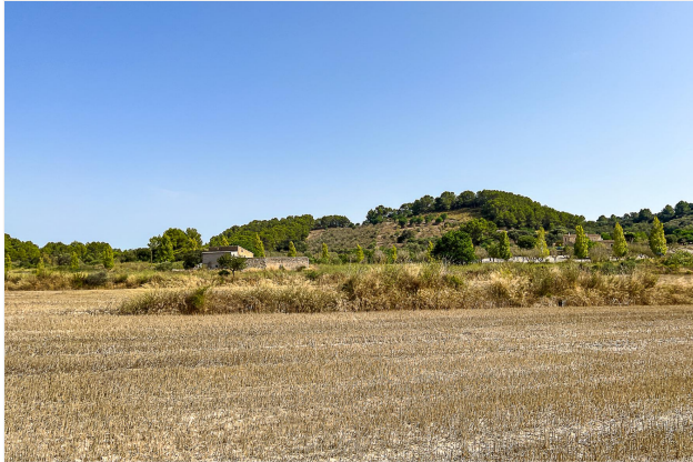
Neighbour with a little house + street