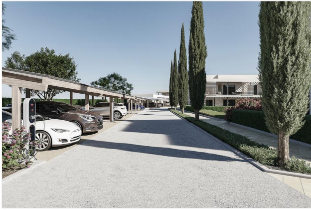
Parking with electrostation