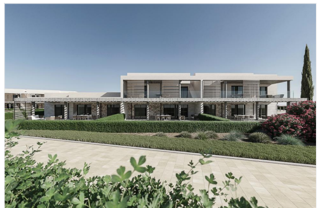
View of the complex