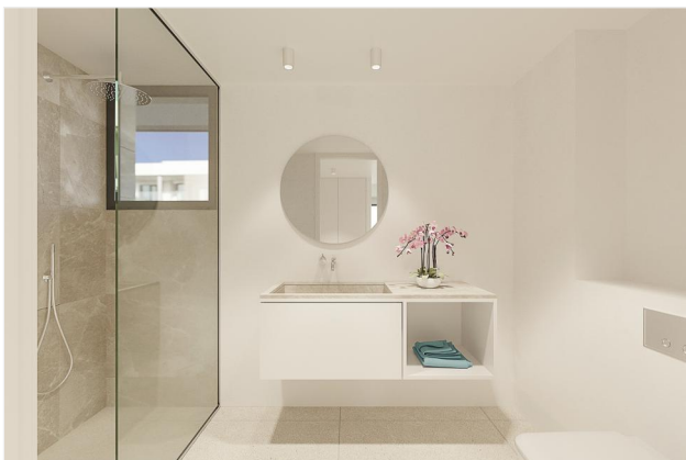
Bathroom with window