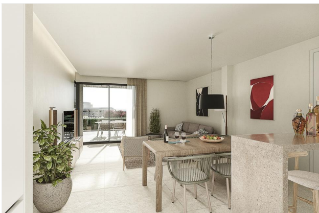
...livingroom and dining area