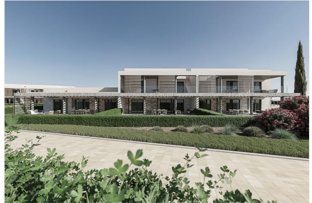
View of the complex