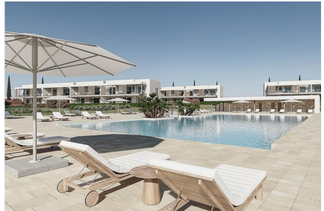
Community pool area