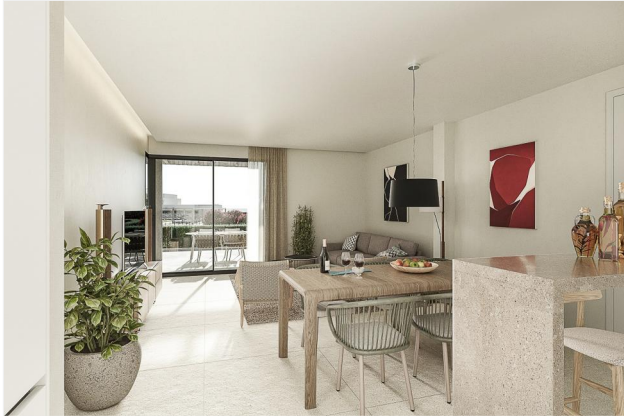
...living and dining room