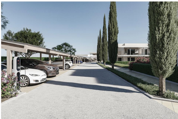
Parking with electrostation