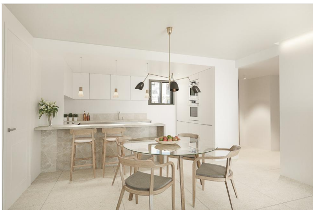
Fitted kitchen and...