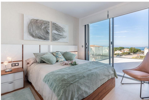
Bedroom with balcony (L-GANCE)