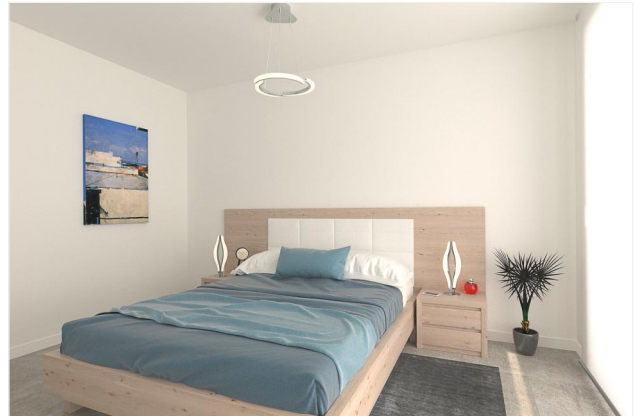
Double bedroom (AKTUAL)