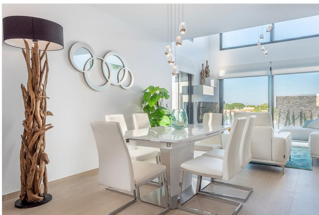
Modern living ambience