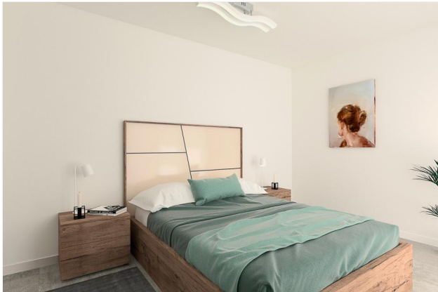
Bedroom furnishing AKTUAL