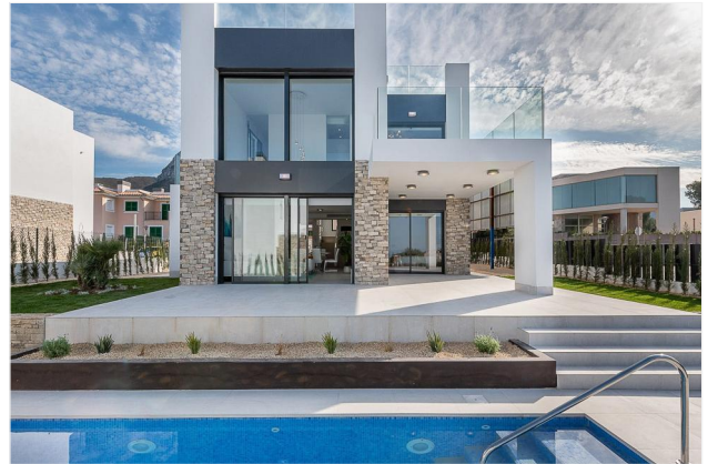
...with private pool