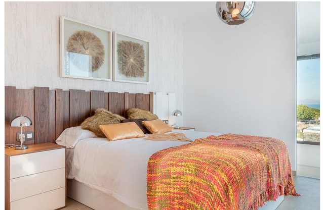
Bedroom example L-GANCE