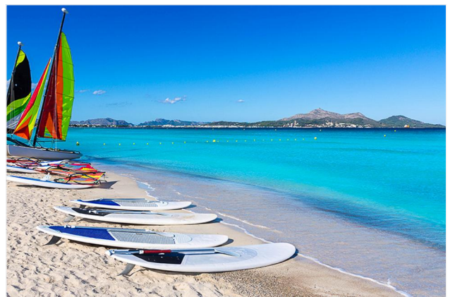
Beach Colònia de Sant Pere