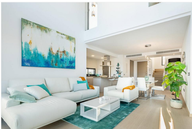
...with a special living ambience...