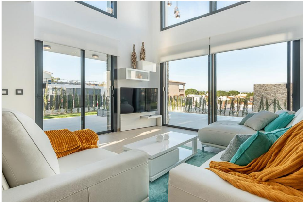
...and view into the garden