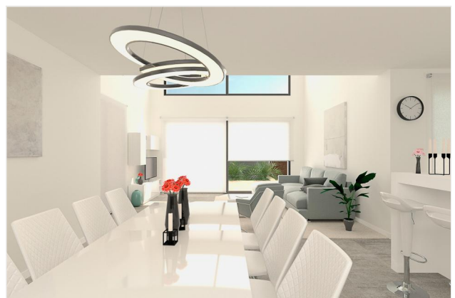
...to the right with open kitchen