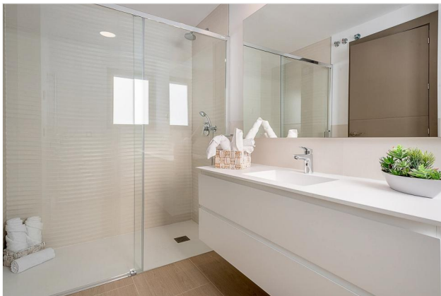
Bathroom with shower