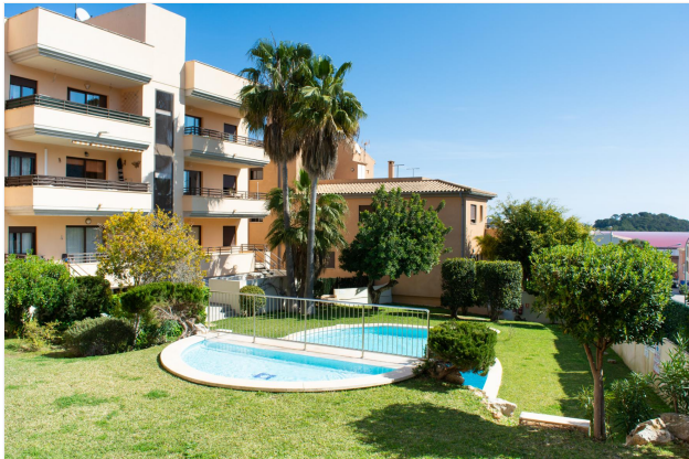
Pool and garden