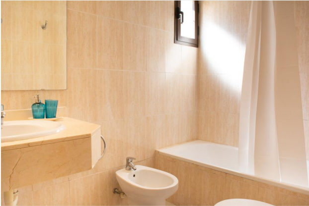
Modern bathroom with tub (en suite)