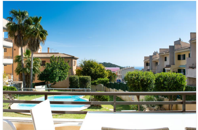
...with view to the pool