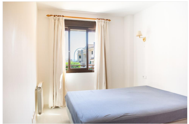
Double bedroom 2...