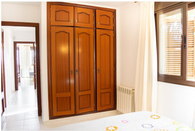
... with fitted-in closet