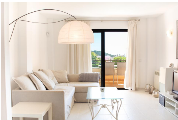
... with modern furniture.