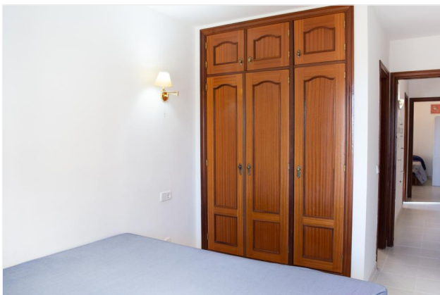
... with built-in closet