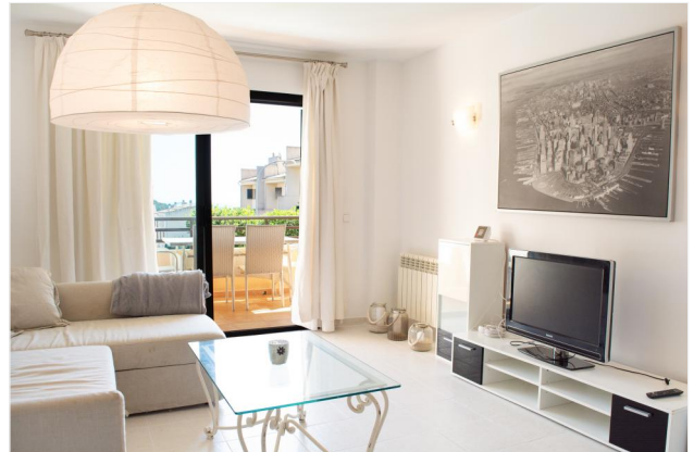
Light flooded living area...