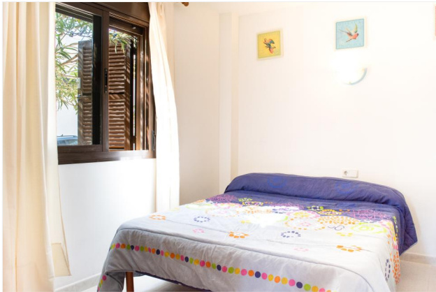
Double bedroom 1...