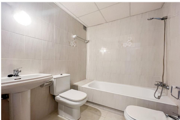
Bathroom with bathtub