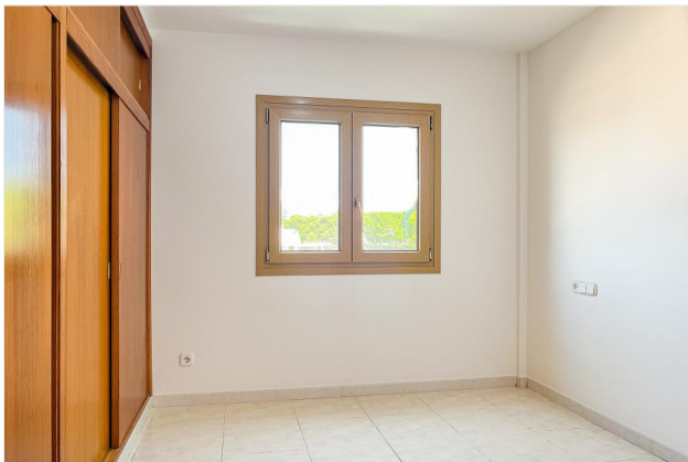
Bedroom with mountain view...