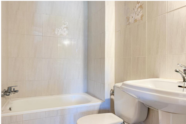
Bathroom with bathtub