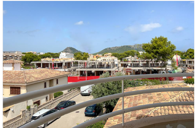
Balcony with distant view