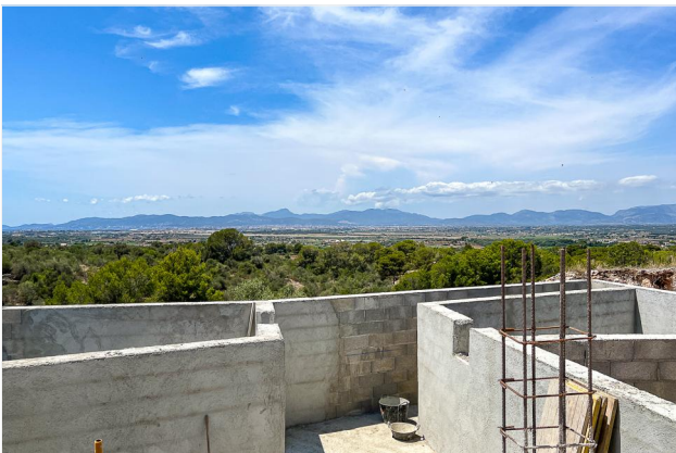
Impressions: Construction started