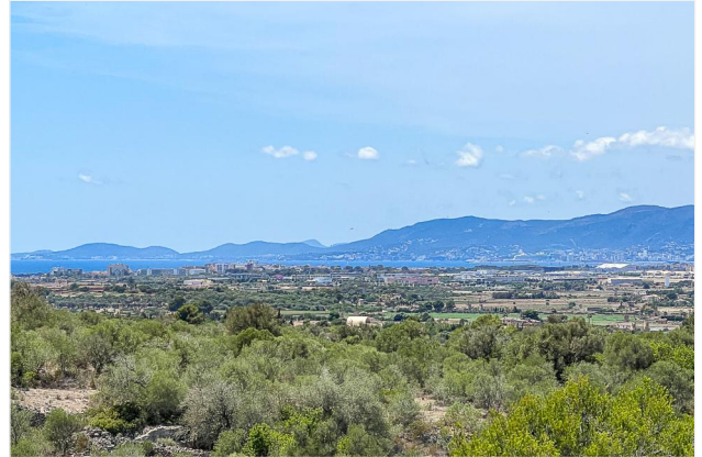
Long distance view over the property