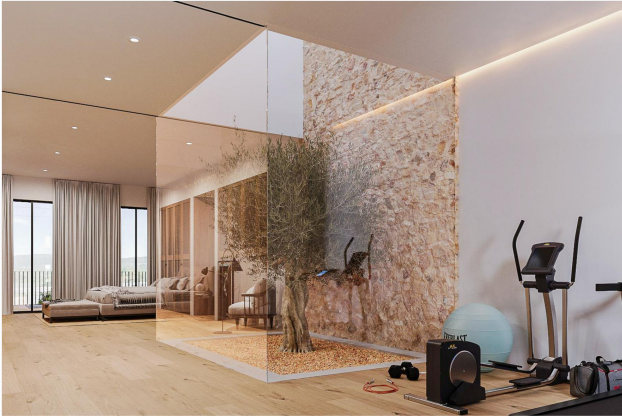
Example master bedroom...