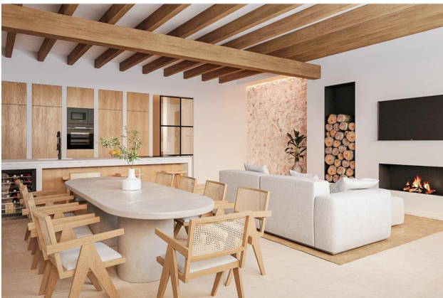
...with an open kitchen