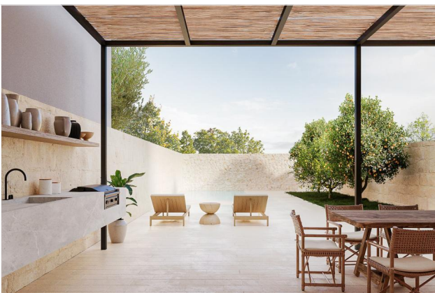
Outdoor terrace with summer kitchen and pool