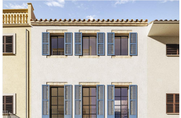
Exterior view of the façade