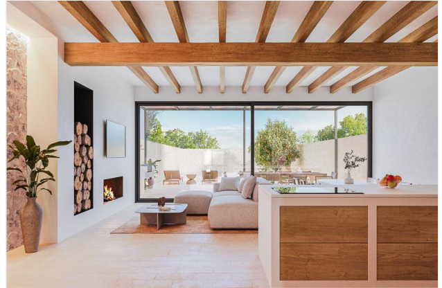
Living example dining and living room..