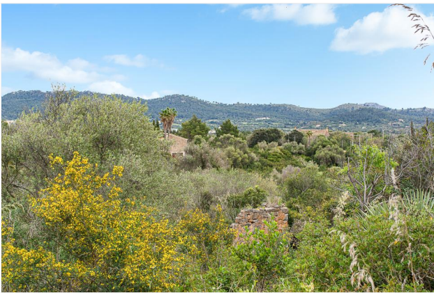
... panoramic view