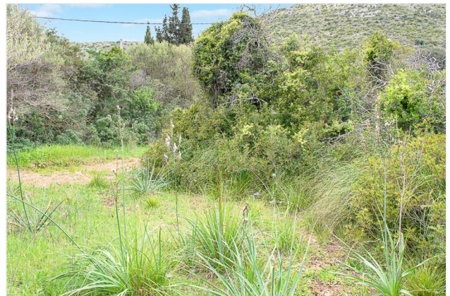
... surrounded by nature