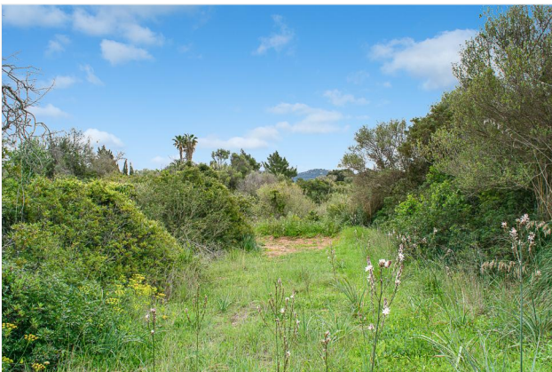
Approx. building place...