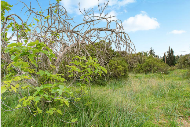
... into the lush nature...