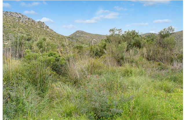
... to the smooth hills