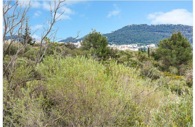
... with marvellous...